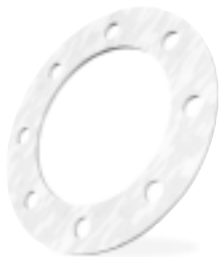
Colour - White