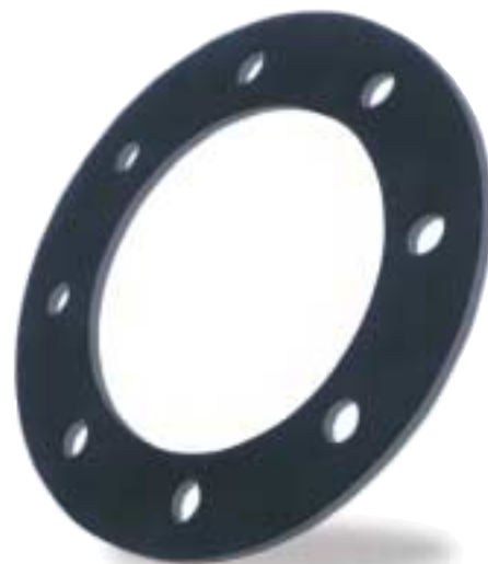
Colour - Black

Manufacturers and distributors of sealing and Jointing Materials