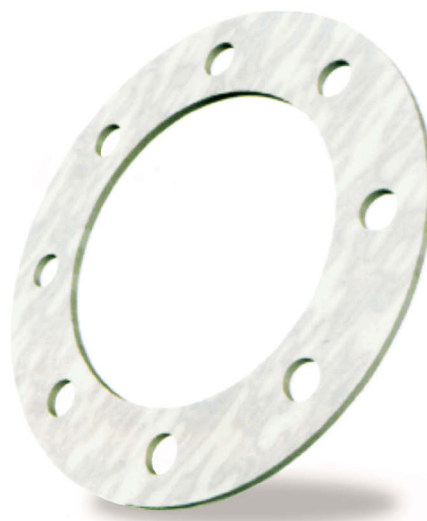
Colour - Off White

Manufacturers and distributors of sealing and Jointing Materials