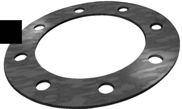
Colour - Black