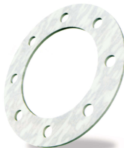
Colour - White

Standard sheet sizes = 1.0m x 1.0m, 1.5m x 1.0m, 2.0m x 1.0m, 1.5m x 1.5m, 2.0m x 1.5m, 2.0m x 2.0m.